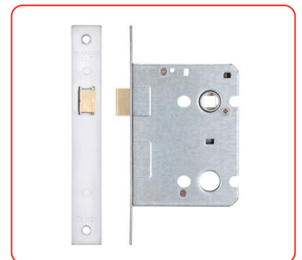
Satin Stainless Steel