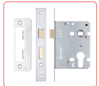
Satin Stainless Steel